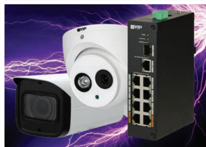
Supports up to 60W Hi-PoE Per Port