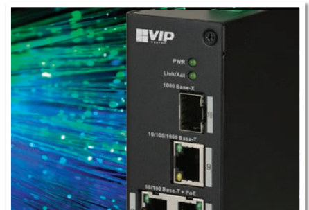
Gigabit RJ45 & SFP Uplink Ports