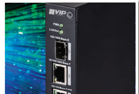
Gigabit RJ45 & SFP Uplink Ports