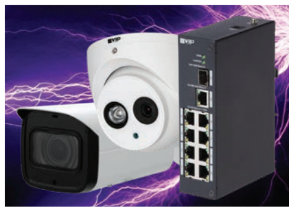
Supports up to 30W PoE+ Per Port