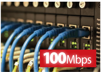
Fast 100Mbps PoE+ Device Ports