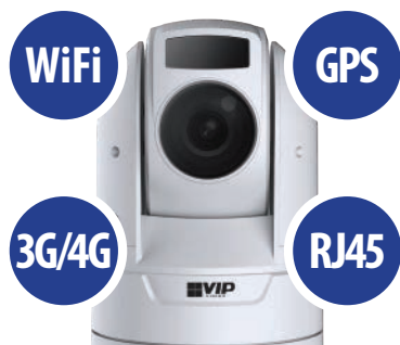
Flexible Networking Formats