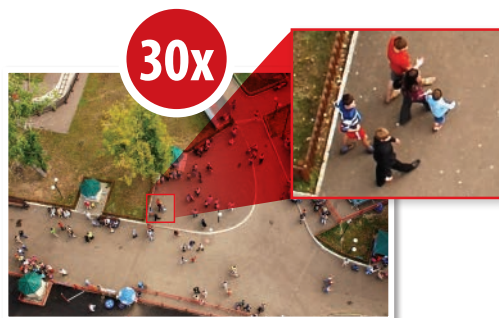
Up to 30x Lossless Optical Zoom