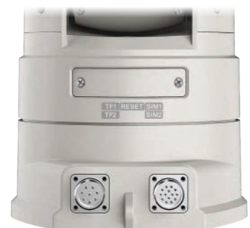
Heavy-Duty Aviation Cables