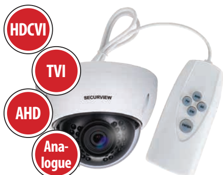
Test, Check & Change Video Output