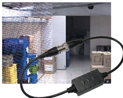
Remove Ground Loop Interference