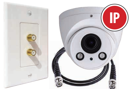
Use Existing Coaxial for IP Installations