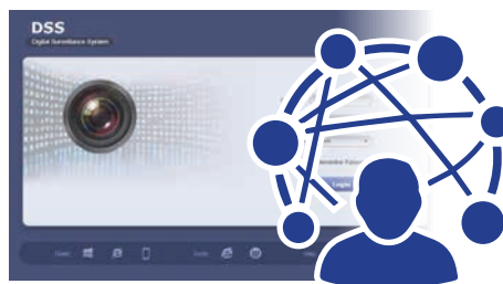
Powerful User Management