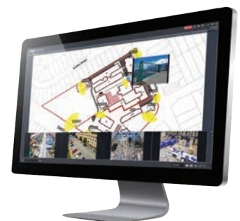
Visualise System with Emap