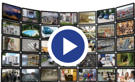
Large Scale Surveillance Management