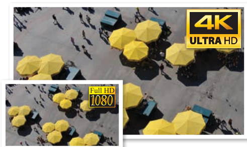
Ultra HD Recording Over Coax