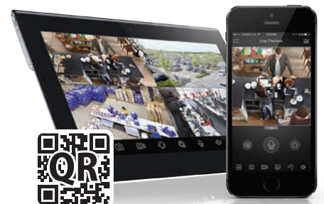
Pro 4K Motorised Turrets