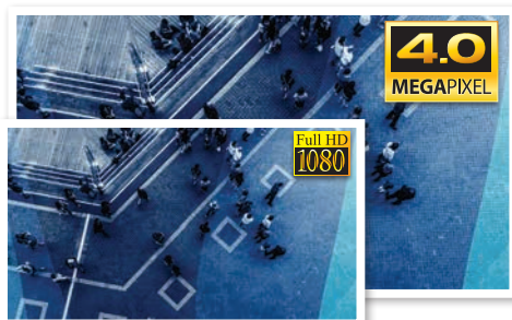
Double Full HD Resolution