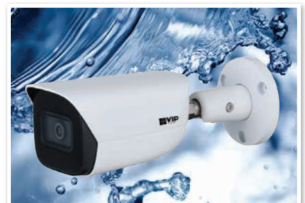
Weather Resistant Housing