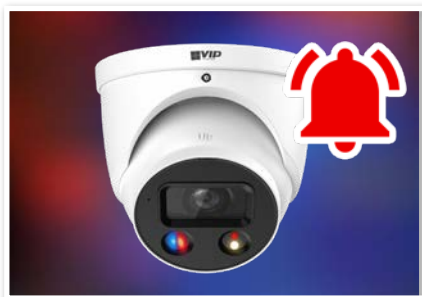
Spotlight, Siren & Blue/Red Strobe