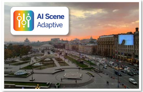
AI Adapts Scene for Best Picture