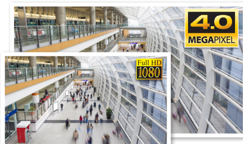
Double Full HD Resolution