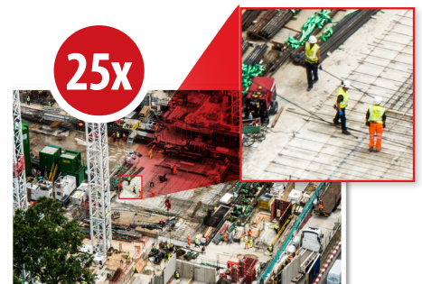
Up to 25x Lossless Optical Zoom