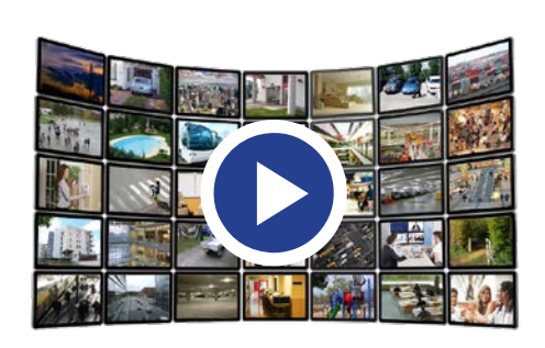
Large Scale Surveillance Management