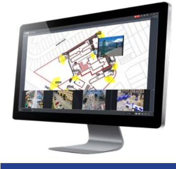
Visualise System with Emap