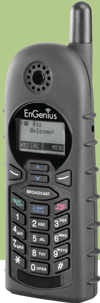
SN 902/ SP922 handset Actual size