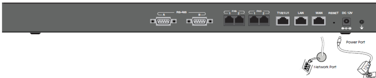
Figure 2: Basic Connection Setup of the HA100

Please refer to the following steps for optional connections on the HA100: