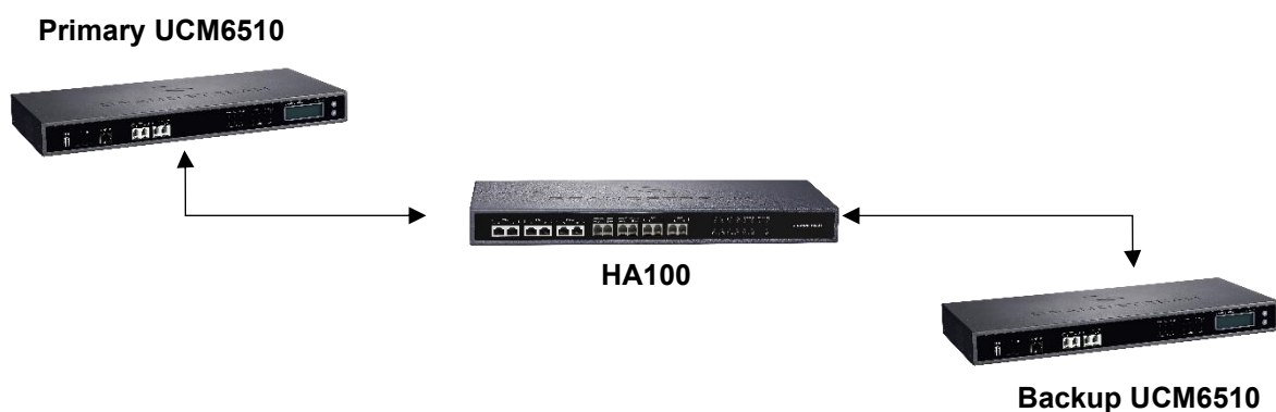
Figure 1: High Availability

Powered by an advanced hardware platform and revolutionary software functionalities, the connection between the UCM6510 and HA100 offers a breakthrough turnkey solution for converged voice, video, data, fax, security surveillance, and mobility applications out of the box without any extra license fees or recurring costs.